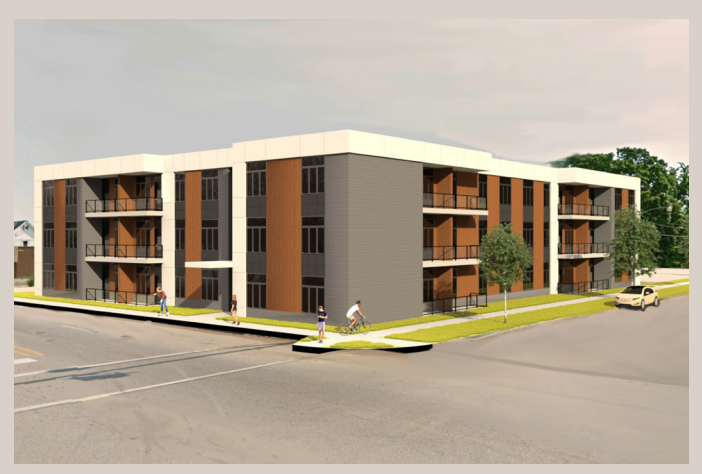
THE BRICKSTONES AT RIVERBEND

In February, Anawim Housing was presented with a $400.00 check from United Healthcare Community Plan to be used towards transportation vouchers for our program tenants. Anawim Housing is grateful for United Healthcare's support and partnership as we work together to aid in the lives and personal journey of our program tenants.