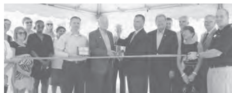
Anawim Housing board members and staff joined us for the ribbon cutting at The Crest at Baker Creek and Baker Creek Senior Living