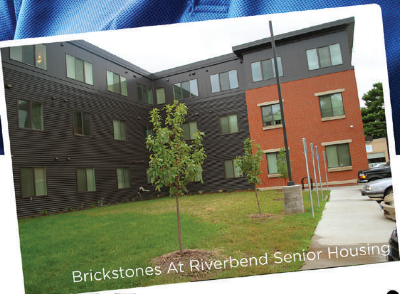
Brickstones At Riverbend Senior Housing